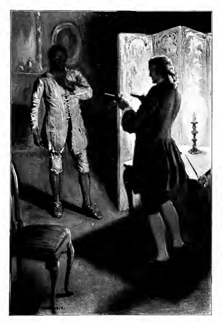
"TAKE ONE SINGLE STEP AND I WILL SHOOT YOU."